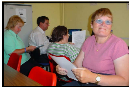
National Open College Network Class

We hold a Quality in Mind award, The Assisted Information Quality Mark awarded by The Legal Services Commission and Investor in People accreditation, after our second successful review.