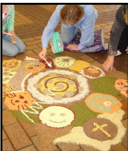
World MH Day - The Mandala